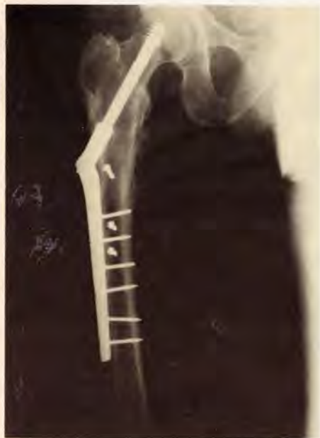
thigh (extreme right) reveal severity of injuries enced an astonishing recovery.