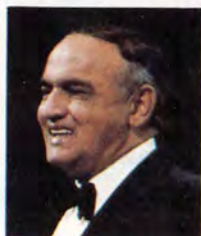
Sir Lionel Luckhoo