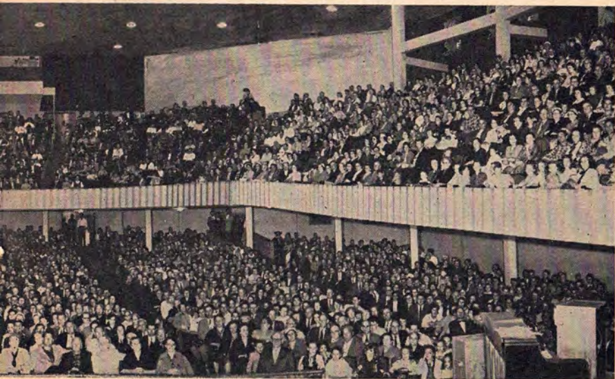
William Branham was the evening speaker and David Duplessis spoke each afternoon.