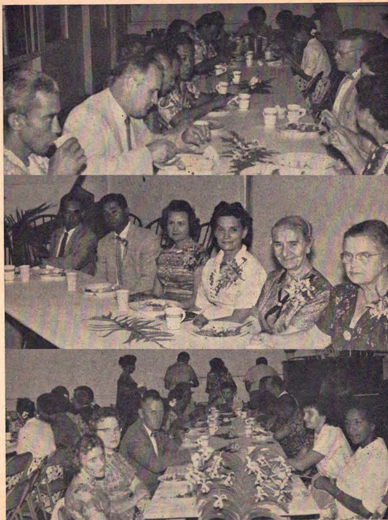
Among the many wonderful meetings held by the FGBMFI visitors from Washington and California during the Hawaii Campaign, one of the greatest was a banquet at