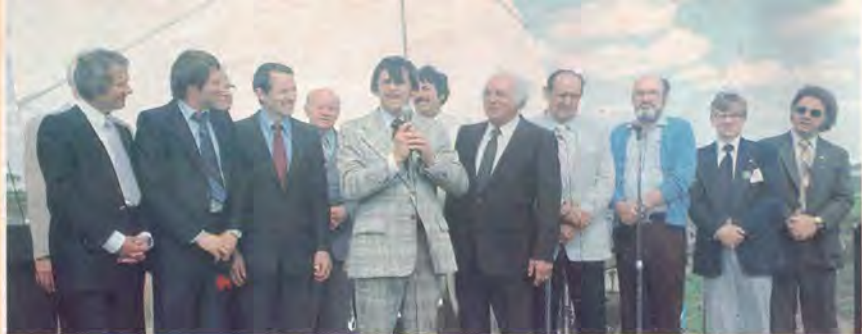
Some of the participants in the dedication ceremony.

was elected president of the Waterloo-Cedar Falls chapter.