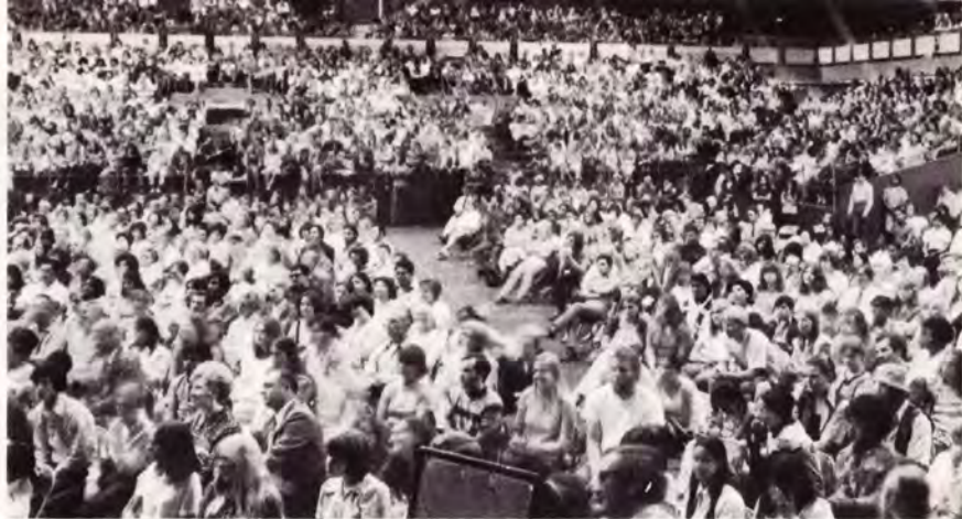
16,000 young people gathered together for the Portland, Oregon outreach.

house of 16,000 in attendance and 2,000 locked out, a tremendous ovation rocked the Coliseum as Jesus Christ was welcomed as honored guest. There was a great sense of the presence of Jesus. At the altar call, in two minutes, over 3,000 people responded to the invitation. Many were weeping as they accepted Jesus Christ as Saviour. That night eight sisters from a foster home accepted the Lord. One entire family received the Lord together; a doctor and his wife; a young man out of prison five days; 80 people from a busload of 87—all received the Lord as Saviour. These were only a few of the many beautiful miracles wrought by God.