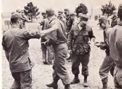
Sergeant at artillery outpost directing distribution of VOICE magazine to his men.