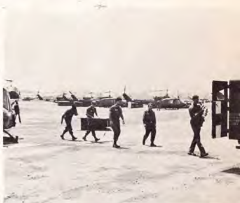
Wounded soldier brought out of swamp by helicopter and taken to waiting ambulance.