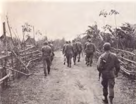
FGBMFI team members join patrol in village near Pleiku.