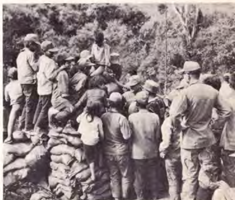
A young Lt. shows Montgnard children how to operate tape recorder.