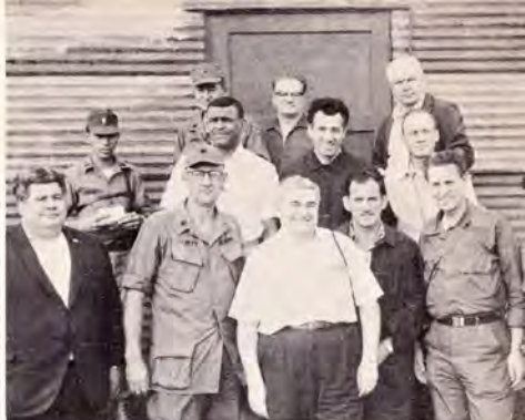
Part of FGBMFI airlift team with Chaplains at Dragon Mountain Base Camp at Pleiku.

Make no mistake about it — the Vietnamese people are not sitting with hands folded waiting for someone to do something for them. They are an industrious and a patient people. Yet they also have the persistence of Nehemiah, who built the walls of Jerusalem in the midst of outside attack by neighboring Sanballat and Tobiah who sought to prevent the restoration of that city. As it was necessary for Nehemiah and his men to build with one hand while holding a weapon for defense in the other, so these Vietnamese people are building under great stress, difficulty and pressure from their neighbors — but they