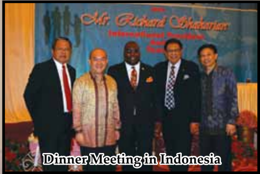
Dinner Meeting in Indonesia