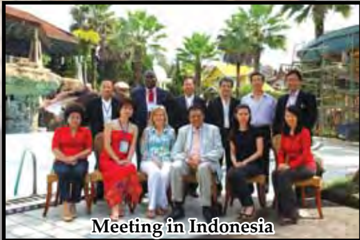
Meeting in Indonesia