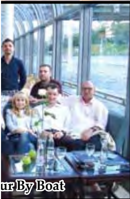
Tour By Boat