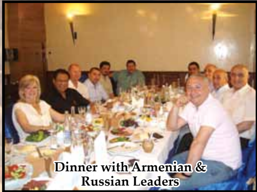
Dinner with Armenian & Russian Leaders