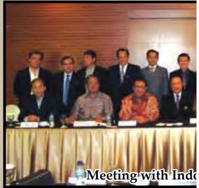
Meeting with Indo