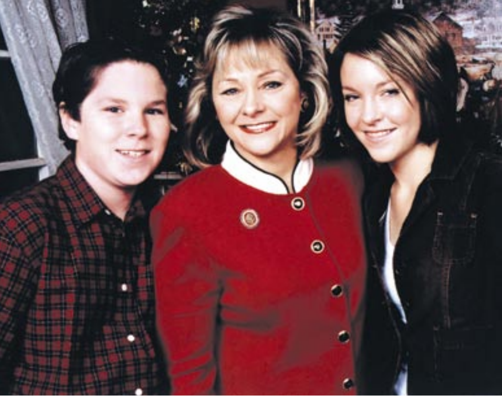
Lieutenant Governor Mary Fallin and her two children.

God is bigger than all the things that I might go through and He is able to handle all that concerns me. I still struggle today with being responsible for my bedridden mother and seeing her so ill. I have prayed so much for her healing and have learned to trust God with her illness that once again, it's not in my control. He has a perfect plan for her life.