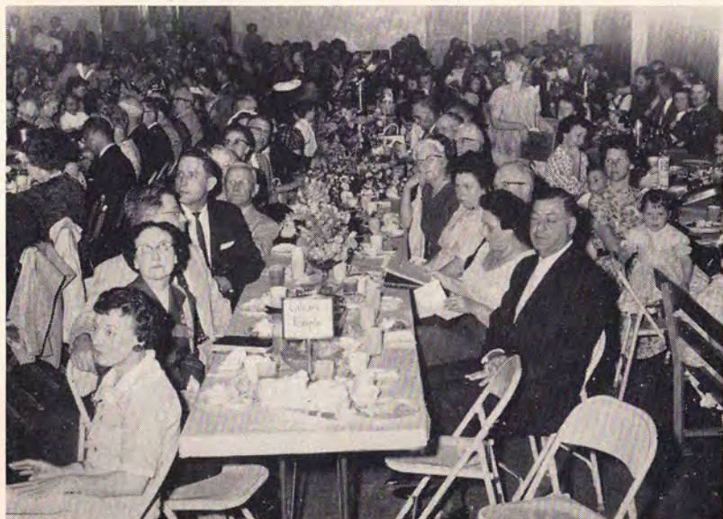
Although the Red Bluff, California, Annual All-Church Festival is primarily for spiritual edification, a bountiful banquet also provides delightful nourishment amidst the fellowship of men, women and children from the many churches represented.

----- Let nothing be done through strife or vainglory; but in lowliness of mind let each esteem the other better than themselves. Philippians 2:3.