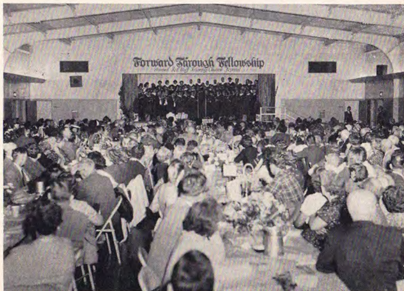
This photo was taken as the Red Bluff High School and combined church choir sang at the Annual All-Church Festival. Only a portion of the more than 800 persons in attendance are shown, representing fifteen churches of numerous denominations.