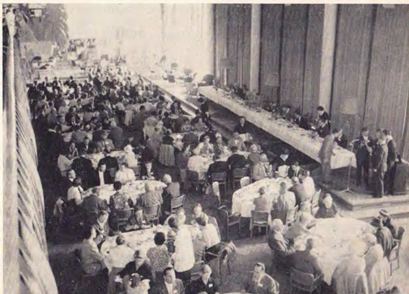
This shows a portion of the large dining hall in Kongresshaus, Zurich, Switzerland, where the Breakfast Meetings of the FGBMFI European Convention were held. Thrilling testimonies by business men and International and Chapter officials were given each morning, preparing many hearts to believe Christ for a great work in their lives.

At these meetings of the Chapters in Holland and Germany, the Lord moved in much the same manner as He does in Chapters that have been established several years in the United States. Members of traditional State Church denominations such as Dutch Reformed, Lutheran, Anglican and Presbyterian, entered into the Pentecostal moving of the Lord as one in Christ. One Pastor stated: "What occurred at the Convention and what has happened at these meetings since the Convention has accomplished more for the evangelization of Europe than