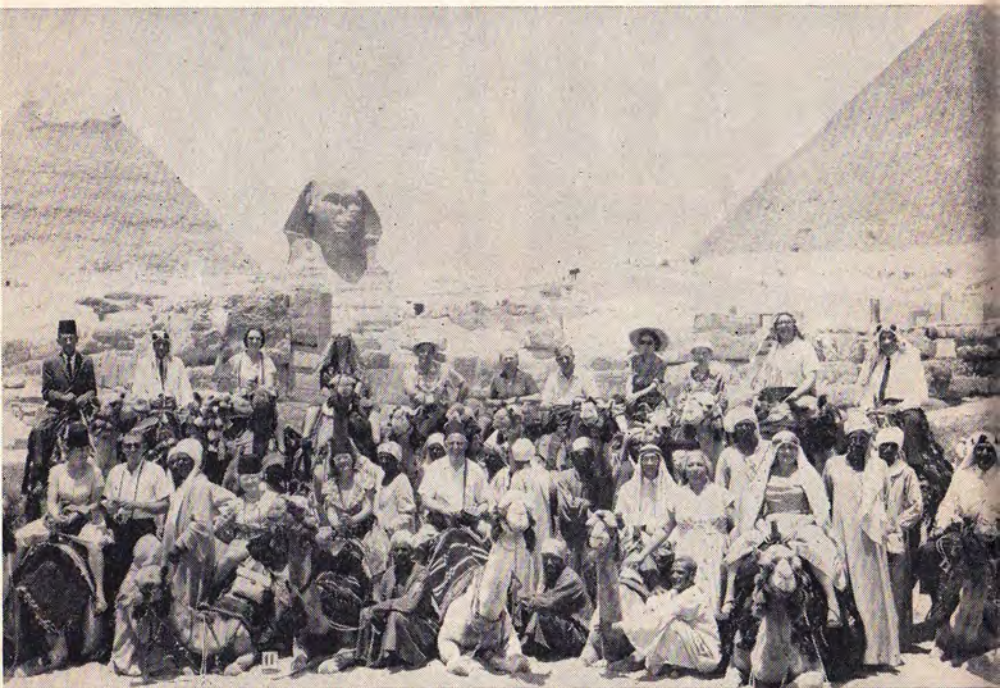
Approximately fifty persons comprised the FGBMFI delegation to the World Pentecostal Conference in Jerusalem, Israel, and the FGBMFI European Convention in Zurich, Switzerland. About half of these flew West and about half flew East. The two groups met in Cairo, Egypt, before going together to Jerusalem and Zurich. Here the delegates had ridden camels to the Sphinx and the Great Pyramid.