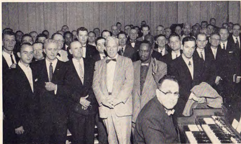
Ministers and laymen worked together as one, forgetting the many denominational affiliations represented among themselves, remembering their unity in the Spirit. Above were some ministers and laymen who participated in the Chicago Chapter campaign.

The Chicago Chapter realizes that a new pace has been established, that great numbers of ministers have been