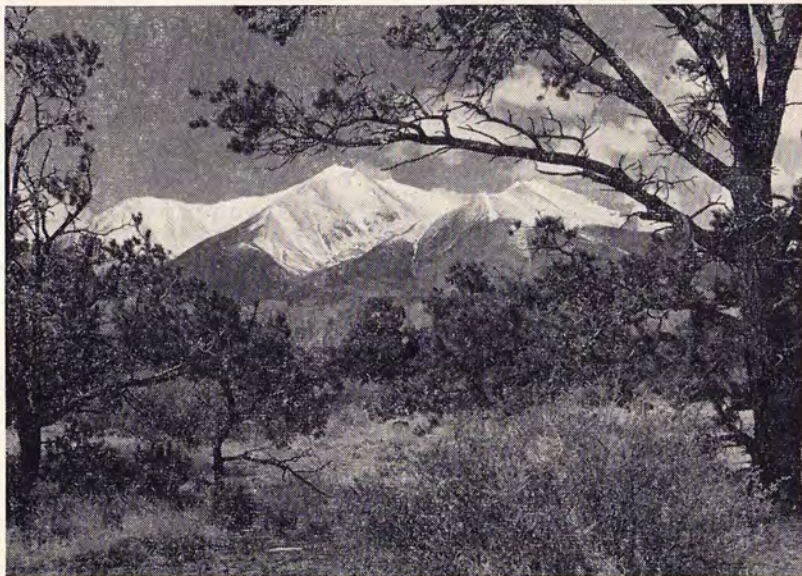
Here is Mount Princeton, Colorado, which towers 14,177 feet above sea level. Its snow-capped peaks invite one to come and enjoy the delightfully air-conditioned climate that is promised those who attend the FGBMFI Regional Convention in Denver.

Many who attended the International Convention at Denver in 1955 are expecting an even greater blessing at the Regional Convention there. God is moving speedily and mightily in these last days. All FGBMFI Conventions are witnessing more and more of the moving and power of God. Denver is expected to be the greatest yet!