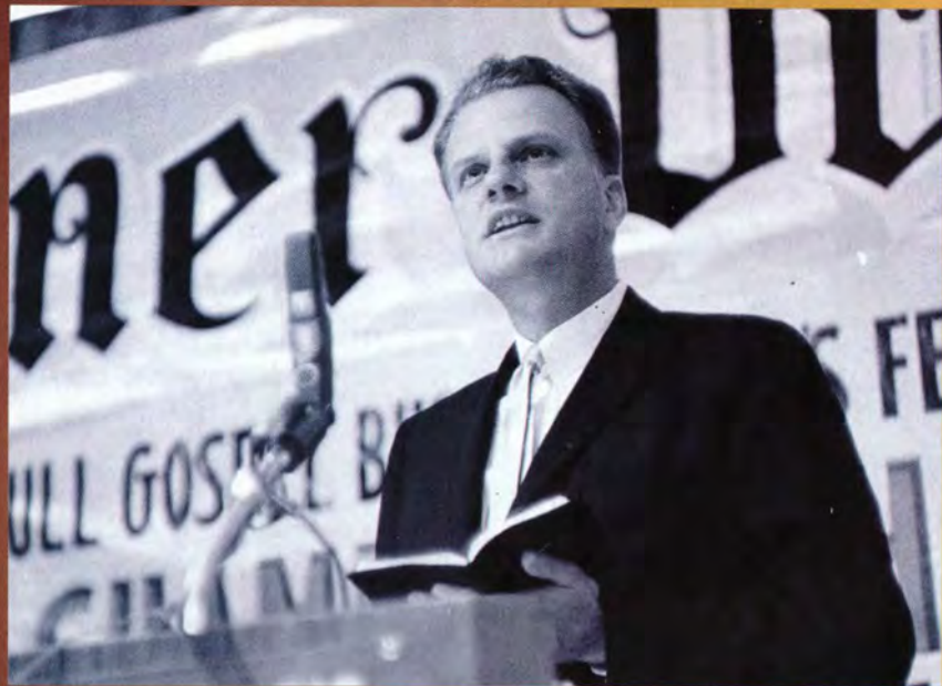
In earlier years, Billy Graham shares at a FGBMFI meeting.

ORDER YOUR 100-PAGE COMMEMORATIVE PICTORIAL JUBILEE BOOK TODAY. (Sample photos from Jubilee Book shown here) See pages 26-27 for details.