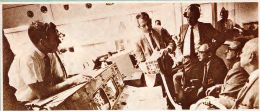
The "jury-rig" solution to the CO 2 problem is tested at the Center before it is relayed to Apollo 13.

guidance system, the spacecraft would either burn up on reentry or skip off and miss the earth's atmosphere entirely, meaning certain death for the astronauts.