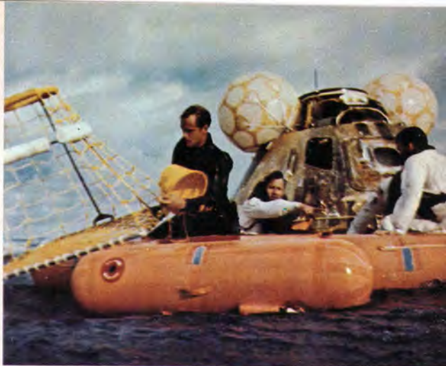
Astronauts Jim Lovell, Fred Haise and John Swigert splash down safely in the Pacific, miles from raging Hurricane Helen.