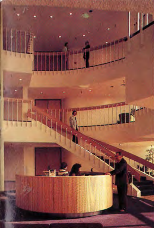
Lobby of World Laymen's Headquarters, Full Gospel Business Men's Fellowship International, Costa Mesa, California. Below: world globe, rotunda.

That vision is becoming a reality through the Fellowship's ministries, now touching eighty-three nations and transcending denominational, racial and cultural barriers. Men interested in participating in this exciting end-time ministry are invited to write Chapter Department, FGBMFI, Box 5050, Costa Mesa, CA 92628.