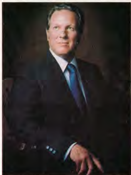
Lic. Rodrigo Carazo Odio, president of republic of Costa Rica.

The Spirit of God came upon me in such a way that I could almost feel fire at my feet. I began praying rapidly in an unknown tongue. At that instant I was delivered from my need for alcohol and cigarettes. Then the door