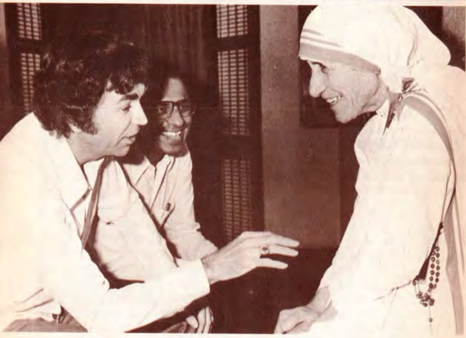
Mother Teresa, winner of the 1979 Nobel Peace Prize, has given her life as an expression of love to the dying of India.

choice. But I am confident God was encouraging me to follow Him instead through portals to places of power so that I might talk about Jesus with leaders of nations.