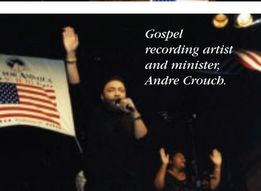
Gospel recording artist and minister, Andre Crouch.