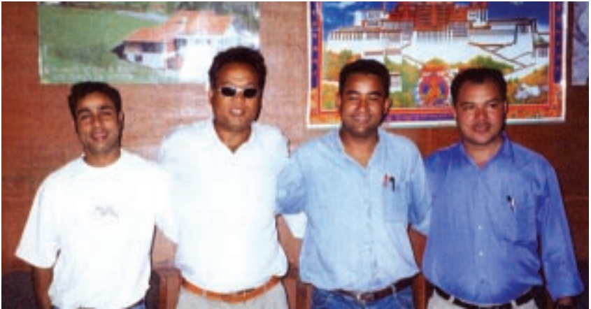
(Above) Officers of the newly formed Chapter in Kathmandu, Nepal.