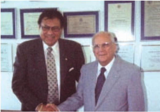
Praying with President Enrique Bolanos of Nicaragua at the Presidential house in mid-October.

There is a mighty revival happening in Nicaragua. Every month in over 350 FGBMFI Chapter meetings, several thousands receive the Lord into their hearts. The Holy Spirit continues to move throughout the entire country as businessmen, from all walks of life, are accepting His love and are responding to the Gospel in the marketplace.