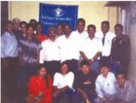
(Left) The group that attended the first Chapter meeting in Kathmandu, Nepal.