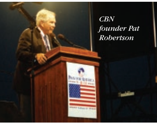
CBN founder Pat Robertson