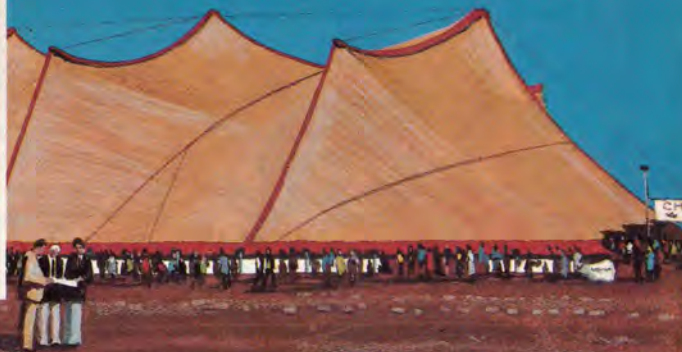
Seven stories high, Bonnke's 35,000-seat tent covers an area equal to three football fields

furniture. The fast-dealing salesman skipped town without delivering the furniture. Reinhard was left to repay the loan. Embarrassed, he told no one about his loss.