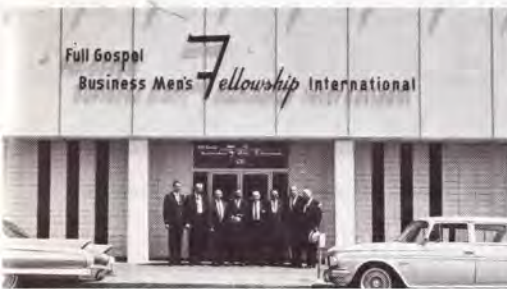
One of the early headquarters' offices of FGBMFI located on Figueroa Street in downtown Los Angeles.

Then new chapters started springing up all across America. Many of the new chapters were organized in the wake of crusades conducted by two leading healing evangelists — Tommy Hicks and Oral Roberts. A major factor in the growth of FGBMFI