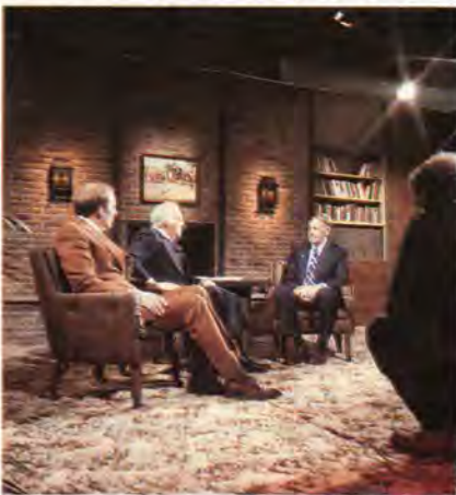
Filming on the set of "Good News."