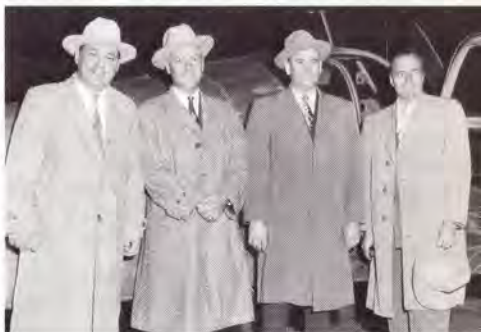
Demos and a group of "barnstormers" flew across the country introducing the Fellowship and establishing new chapters.

The meetings at Clifton's Cafeteria in Los Angeles began to grow. From the 15 to 40 men who came for most of 1952, the numbers shot up to 300 and 400! The new Voice magazine became an important tool for recruiting new members and spreading the message of FGBMFI over the nation.