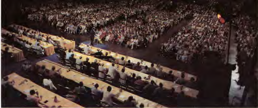
The Fellowship's future is bright and growing.