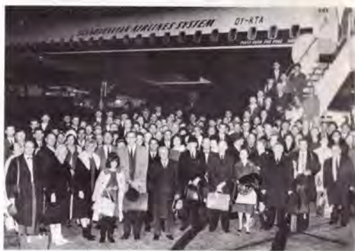
The plane from New York arrives in London.

Convention services were held in the London Hilton Hotel, Westminster Hall and Royal Albert Hall. People questioned the wisdom of using Royal Albert